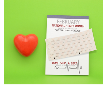
American Heart Month