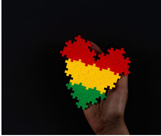
Black History Month