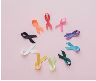
National Cancer Prevention Month