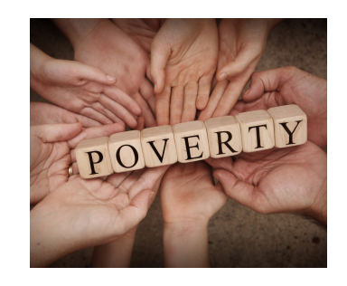
January 2023 Poverty Awareness Month