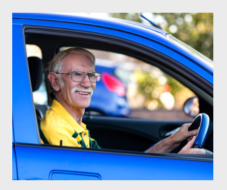
Please share this amazing opportunity with friends, family, clients, and the community.