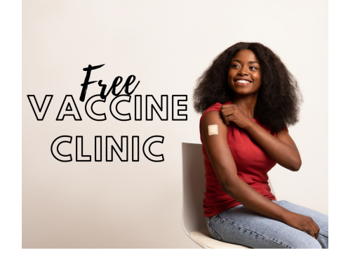
<u>Click here</u> to download flyer. Please pass along the vaccine clinic information to partners and clients.