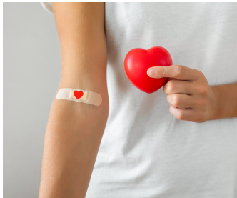
June 14th World Blood Donor Day