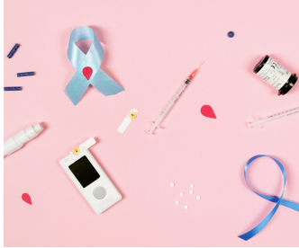
June 12th-June 18th Diabetes Awareness Week