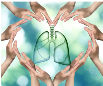
June 15th National Clear Air Day