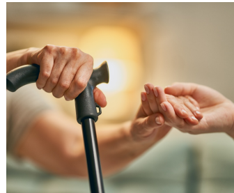
June 15th World Elder Abuse Awareness Day