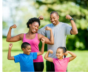
June 12 Family Health and Fitness Day