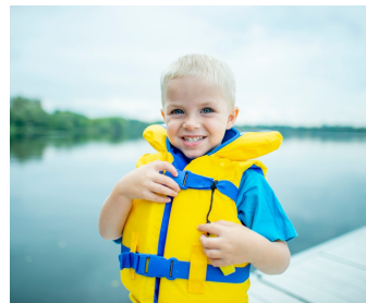
June 17th Drowning Prevention Week