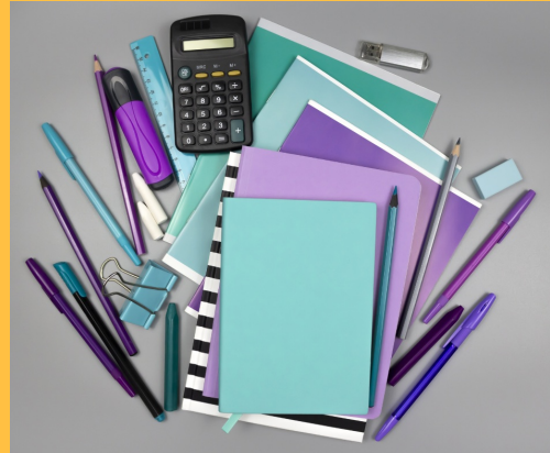
Archived from July's Provider Edition

In Chemung County, Catholic Charities has partnered with Strong Kids Safe Kids to distribute backpacks and school supply starter kits at the Annual Strong Kids Safe Kids event on August 26 from 11 am – 2 pm at the Chemung County Fairgrounds. No registration is required. New backpacks will be available for students in kindergarten to 6 th grade.