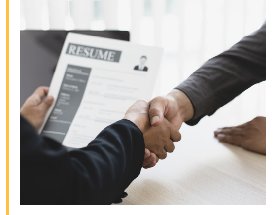
Catholic Charities Chemung & Yates